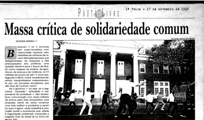
Foto: Moura das salas de tal-til-classes para os educadores norte-americanos residentes no Encontro 441 de Proteção Ambiental